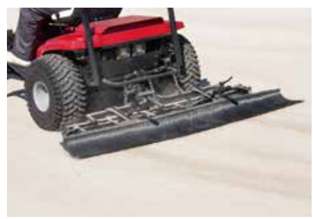
The Brush option beautifully finishes the bunker surface.