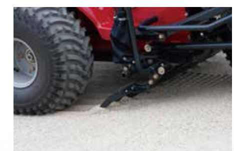
The cultivator option breaks up and softens coarse sand.