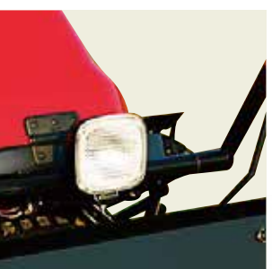
The headlight options are mounted on the front and rear. These lights are useful for early morning operation.