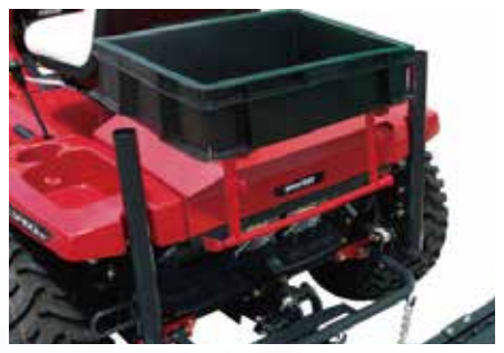
The cargo box option allows operator to carr cooler, walkie-talkie and other necessary tools.